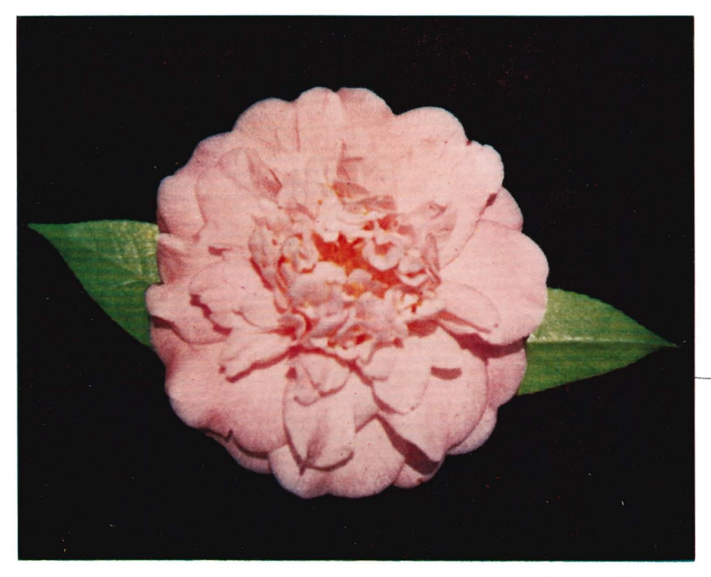
Hybrid 203

A Publication of the Southern California Camellia Society